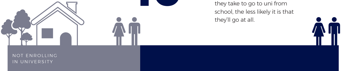
REGIONAL STUDENTS WITH AN ATAR OVER 75

of regional students with an ATAR over 75 aren't going to university from school. Research shows that the longer they take to go to uni from school, the less likely it is that they'll go at all.